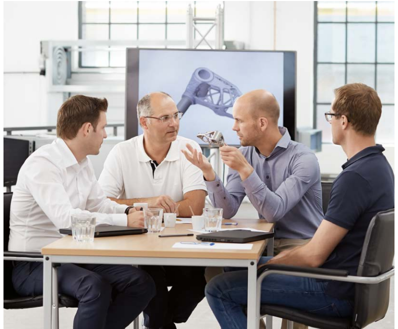
Sustainable and high-quality steel from voestalpine for modern living.

voestalpine has been actively fulfilling its economic, social and ecological responsibilities for many years. It supports the UN Global Compact – the world's largest and most important initiative for responsible corporate governance – and participates in industry initiatives dedicated to sustainable steel production, including ResponsibleSteel. voestalpine is also included in the international FTSE4Good Sustainability Index.